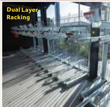
Dual Layer Racking