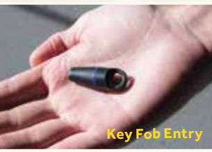
Key Fob Entry